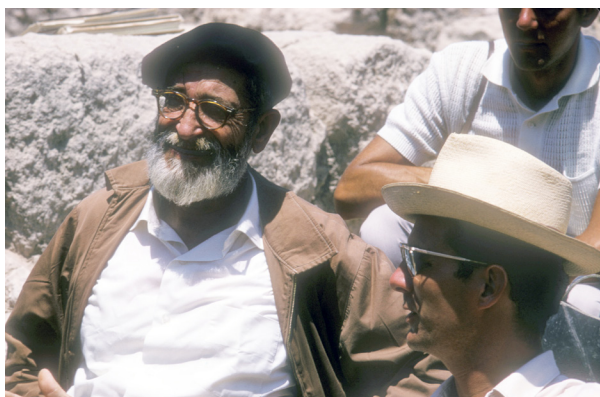
Figure 5: Pere Roland De Vaux with William Dever at Gezer 1969.

any of the other ancient Near Eastern texts. Nevertheless, despite a general methodological consensus, some Israelis have fallen into criticising each other for being either ‘too Biblical’, or ‘not Biblical enough’. 6 Meanwhile, in wider circles, there is a growing recognition, even among Biblicists, that even at best the biblical texts are now ‘secondary’ sources (with Lester Grabbe, Ernest Axel Knauf and others). In future, it is the archaeological data that will be our primary source for writing any new and better histories of ancient Israel, or for that matter, of Jordan, Syria, or anywhere else in the Levant. 7