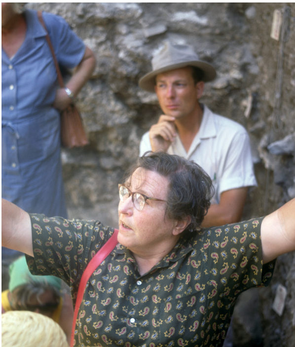
Figure 3: Dame Kathleen Kenyon at Gezer in 1967 with William Dever looking on.