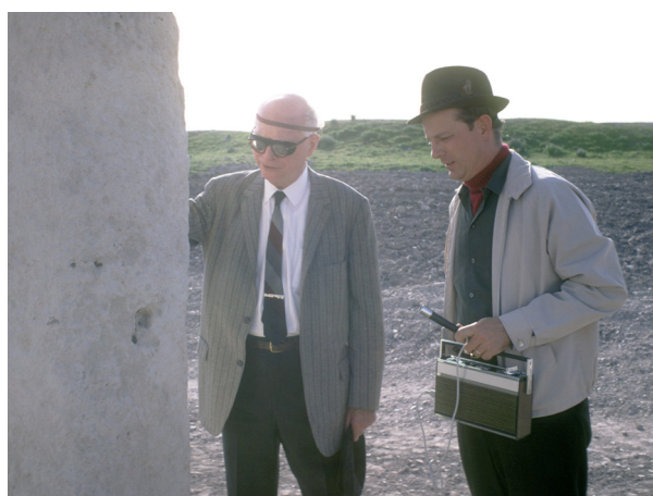
Figure 1: Professor William Albright with William Dever at Gezer 1969.

One can assess a revolution in large part by its slogans and its success. The three ‘watchwords’ of the revolution that began in the early 1970s, and soon gained momentum, were specialisation , professionalisation and secularisation . Let’s see how they fared.