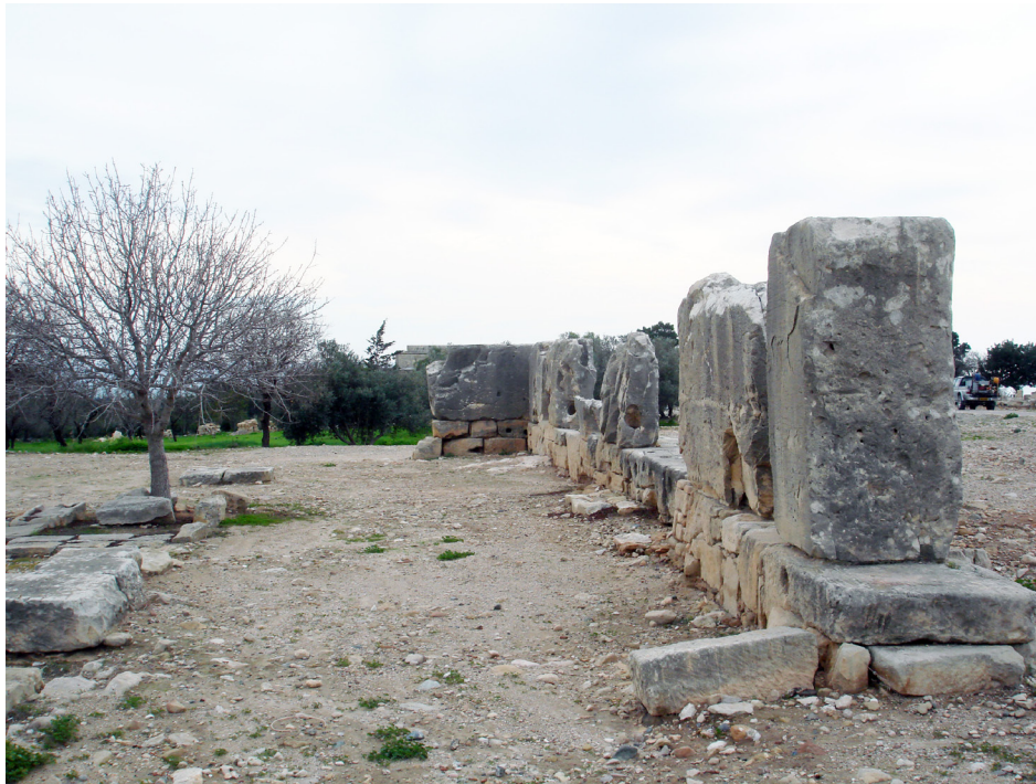
Figure 4: Bronze Age walls from the sanctuary of Aphrodite at Kouklia.

but we only have their names not their dioceses (Hill 1940: 250). Either the Cypriot church was already organized before 325, and now fully in the open, or more likely, it was expanding rapidly with 9 new hierarchs.