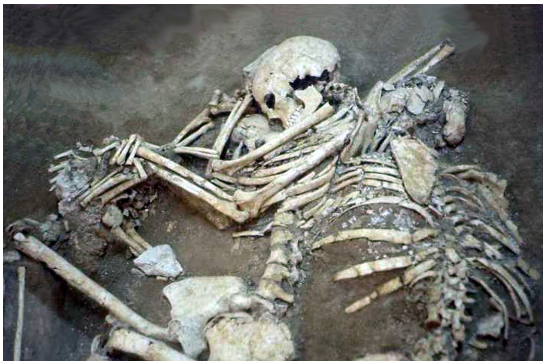
Figure 5: The remains of the Kourion family huddled together in an attempt to survive the fourth century earthquake.

The destruction of the major pagan sanctuaries strikes at the heart of traditional pagan Cypriot beliefs and practices. Why was this allowed to happen? If the gods in their anger at the loss of worship and the rise of Christianity allowed the total destruction of their own shrines when sacrifices and offerings could be freely offered, what does that mean for the future?