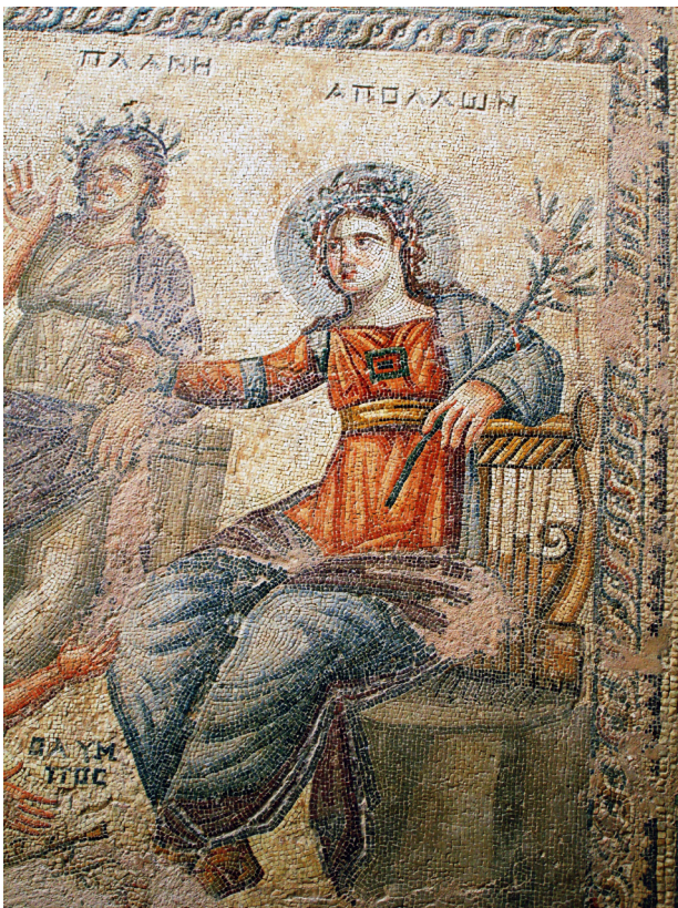
Figure 6: The Judgment of Apollo from the House of Aion, Paphos.

Cassiopeia over the sea creatures which stand for matter in the neoplatonic world. The punishment of Marysas by Apollo is illustrative of the price the soul must pay on its journey (Figure 6). Suffering has a purifying meaning. This is highlighted in the way the Dionysian procession is shown in the mosaic. Instead of an exuberant bacchic party, it is a solemn procession, signifying that death is only a passage to a different life (Figure 7). The Christian echoes are deliberate, an attempt to refute the new faith. ‘We perceive in the Paphos mosaic, the desire of rich and cultured people, following traditional beliefs, to oppose the new religion by using or changing the ancient schemas which under a similar form are or will be used in the same way by Christians...’ [the pagans of Paphos were] ‘using the myths allegorically to show the neoplatonist way of salvation, while at the same time counterbalancing Christian teaching’ (Daszewski 1998).