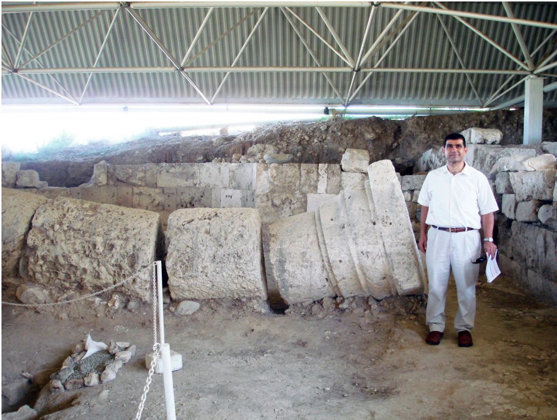
Figure 9: Destruction debris at the Basilica of Soloi.