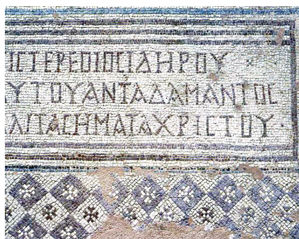
Figure 8: Mosaic inscription from the House of Eustolios, Kourion.

church building. For example, at Kourion, Demos Christou has excavated a small church built in the earthquake ruins of the Nymphaeum in the forum, which he believes was constructed almost immediately after the quake and went out of use with construction of the grand basilica by Bishop Zeno after AD 410 (Christou 2007).