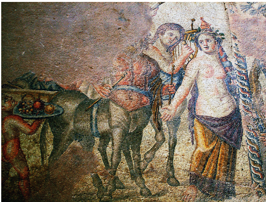
Figure 7: The Dionysian procession from the House of Aion, Paphos.