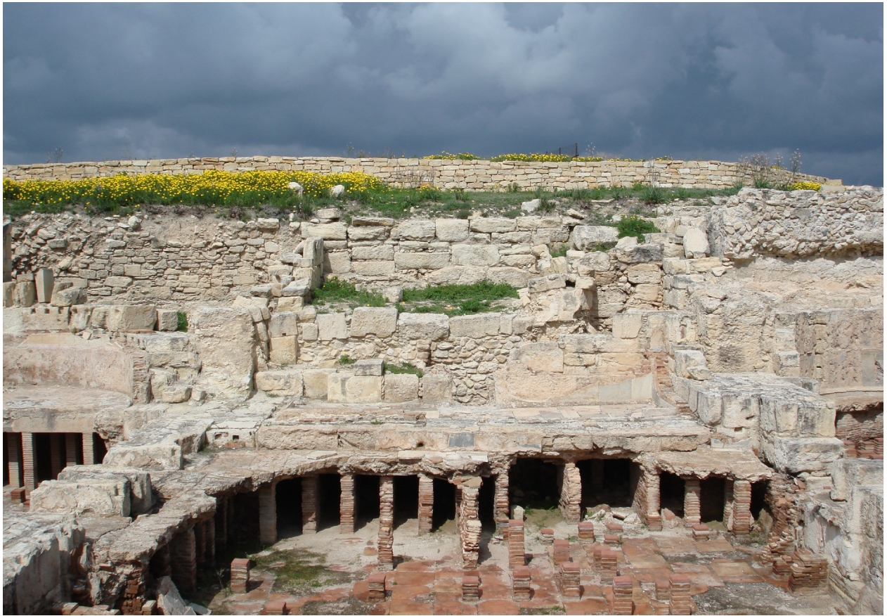
Figure 3: The Civic Baths at Kourion.