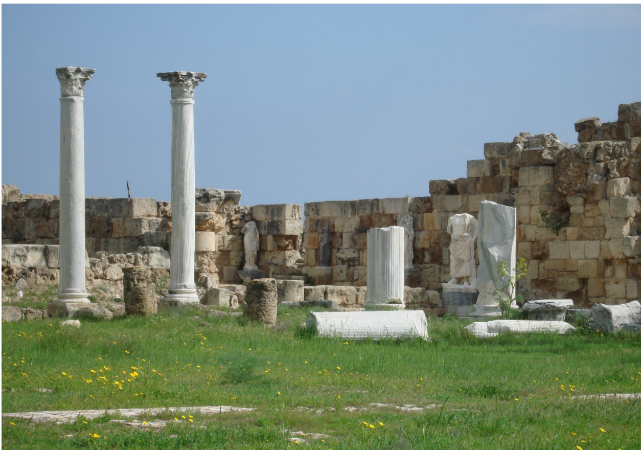
Figure 2: The Gymnasium complex at Salamis, restored by Trajan and Hadrian following the Diaspora revolt in AD 117.

obscurity' (1980:1295). Inscriptions and coins together record only 48 proconsuls from 22 BC to AD 293, less than 1/6 of the total (Mitford 1980:1299). The proconsul served for only a 1 year term; Mitford points out that this short period of office prevented corruption. In consequence,