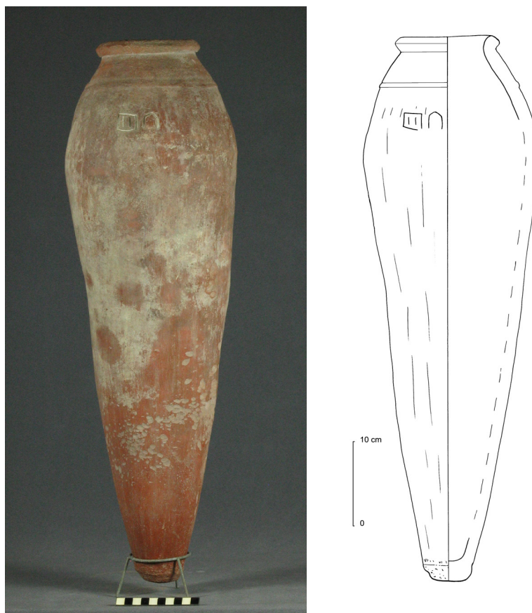
Figure 1: The storage jar IA1.2111. (Photo: H. Huggins and Drawn: C.J. Davey)

1913: pl. LVI) 2 and falls within Hendrickx's (1996: 65) Naqada IIIC-D. The middle and lower part of the vessel was handmade while the neck and rim were made from a separate coil and finished on a turning device. The exterior has been coated with a brown-red slip and the body has been finished with vertical burnishing. The vessel is made of a Nile Silt fabric. There is some pitting to the lower half of the body and evidence of salt damage. The vessel is 650 mm in height with a maximum diameter of 200 mm and a rim diameter of 120 mm. The potmark is deeply and neatly