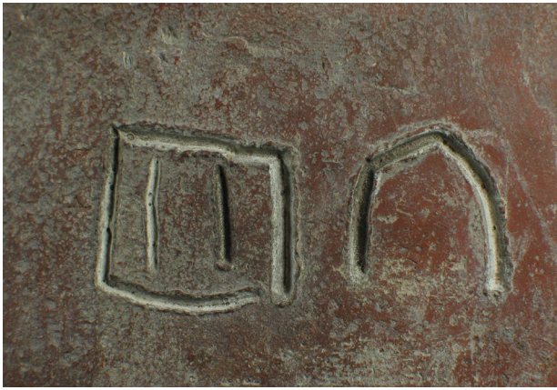
Figure 2: Incised mark on storage jar IA1.2111.

incised below the horizontal ridge in the upper body. The mark is composed of a square containing two vertical lines running from the top to almost the bottom of the frame and a secondary sign that appears to be an inverted U (Figure 2). The mark also appears to have been infilled with a white pigment, perhaps a calcium or calcium sulphate mixture. The vessel has recently been accessioned as IA1.2111.