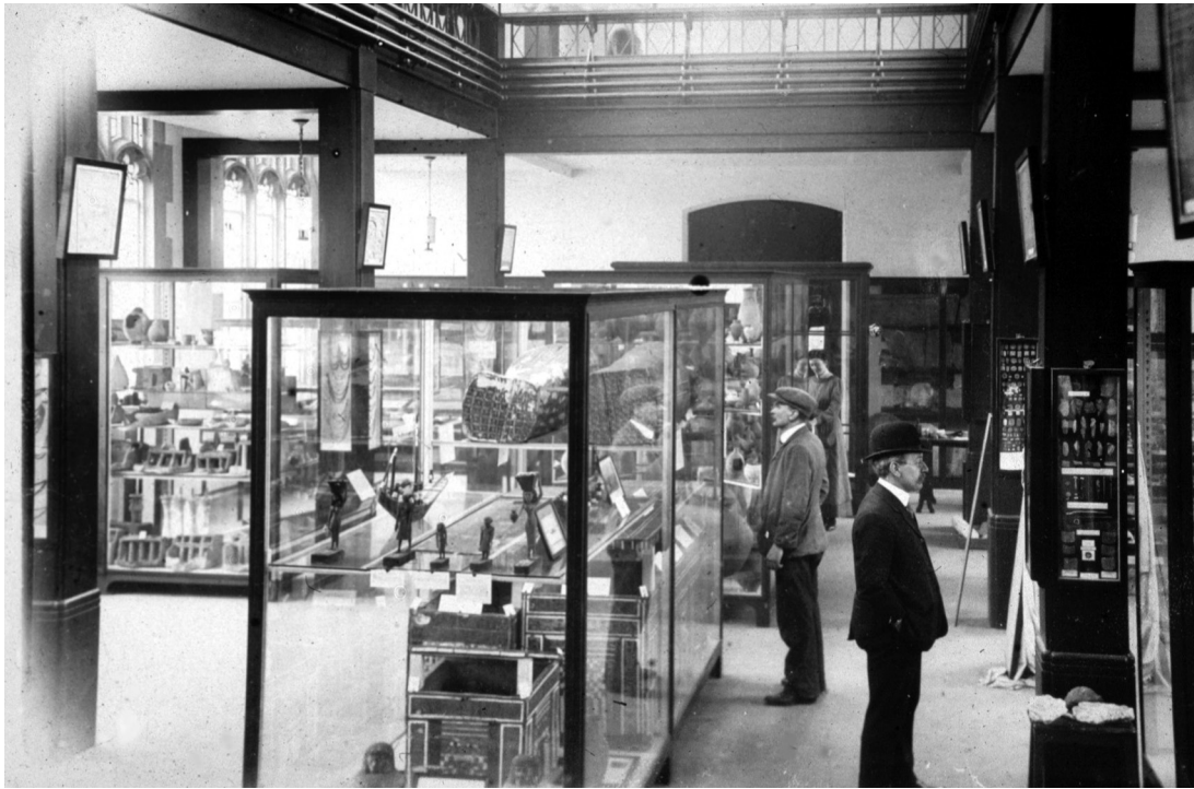
Figure 3: The Egyptian Gallery in The Jesse Haworth Building, Manchester Museum, when it was first opened in 1912. The central case displays the tomb group of the Two Brothers.