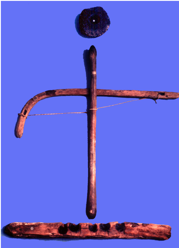
Figure 2: A fire-stick discovered at Kahun (c.1890 BC). Such items of domestic use are rare from Egypt, since most evidence is derived from funerary sites.

He kept journals giving some details of his work, but the exact find spot of most objects are not recorded. Sometimes, he comments on his more unusual discoveries, such as the babies he found buried amongst the houses (Petrie's Journal April 8 -15, 1889):