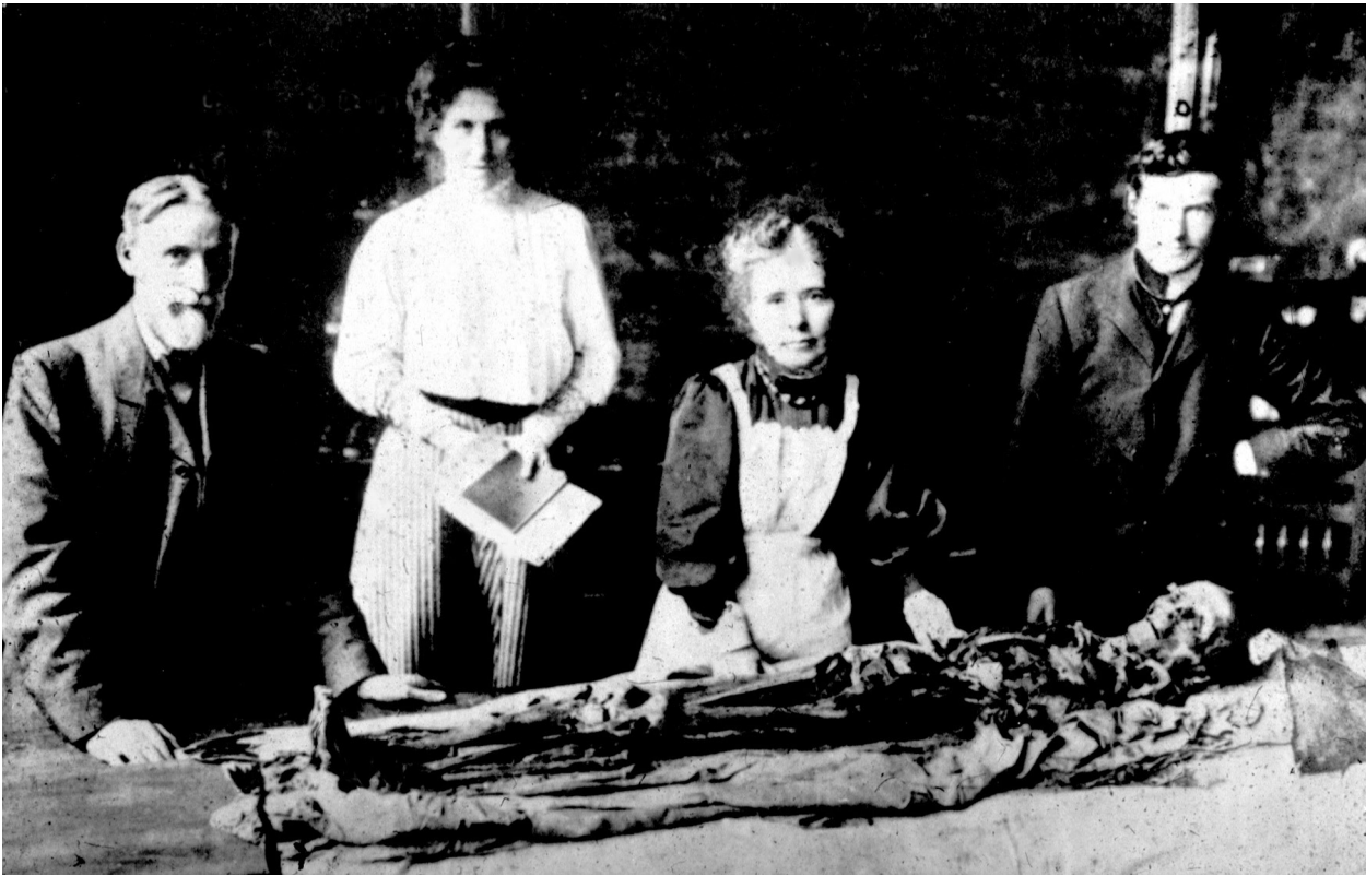
Figure 5: Dr Margaret Murray (third from left) and some of her team, unwrapping the mummy of Khnum-Nakht, one of the Two Brothers, at the University of Manchester in 1908.