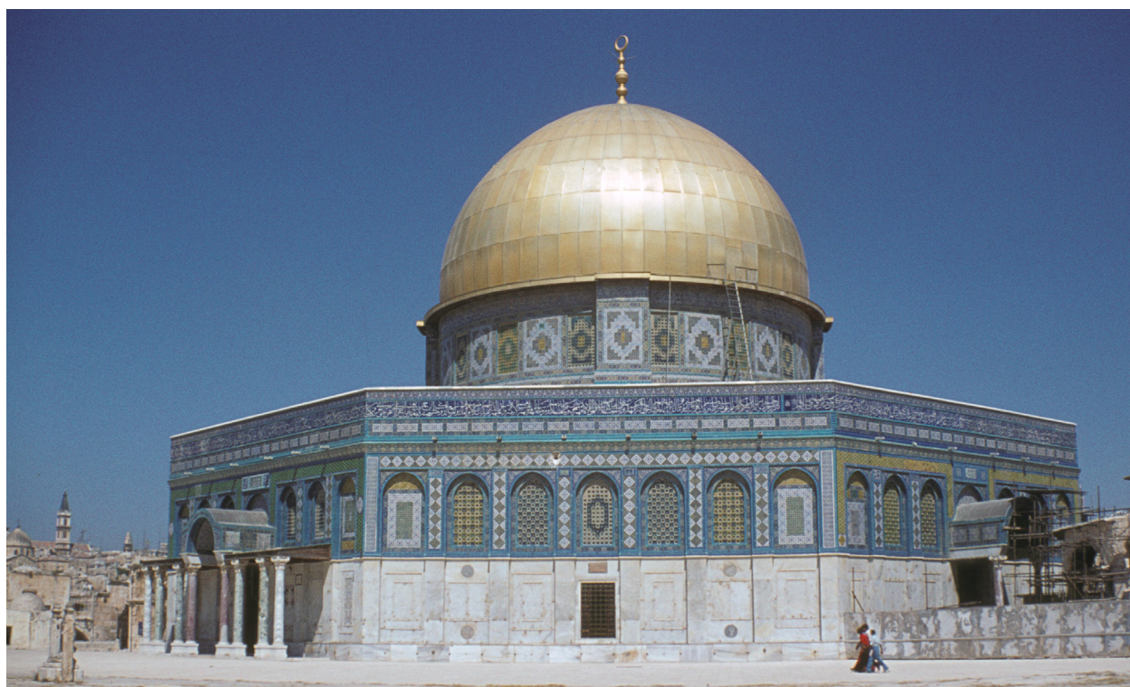
Figure 1: A general view of the Dome of the Rock. Image: CJ Davey 1974

Not only have nations come and gone, and armies trampled this sacred space, but nature itself seems determined to rearrange its own landscape repeatedly if not regularly by