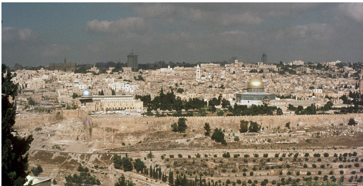
Figure 6: Jerusalem showing how Caliph 'Abd al-Malik succeeded in eclipsing the Church of the Holy Sepulchre.

statement architecturally articulated in the Church of the Holy Sepulchre, and to assert the primacy of Jerusalem as the holy city, hence in contrast with or as superior to, Mecca. The historian Muqaddasi, (10th century C.E.) suggests that the magnificent size and shape of the Dome of the Rock are a reaction and response to the Church of the Holy Sepulchre: "And in like manner the Caliph 'Abd al-Malik, noting the greatness of the Church of the Holy Sepulchre and its magnificence, was moved lest it should dazzle the minds of the Muslims, and hence erected above the Rock a dome which is now to be seen there." (Duncan 1972:28) Muqaddasi is two hundred years removed from the construction of the Dome, but it is understandable and a generally accepted tradition that 'Abd al-Malik desired to surpass the Church of the Holy Sepulchre as either a symbolic victory over, or symbolic potential absorption of, Christianity (Figure 6). Architectural rivalry was prevalent at the time as demonstrated by the comment of Bayt Al-Maqdis : "The Syrian Muslims wanted to surpass the dome which covered the spot from which Christ had ascended to Heaven, by constructing a new one which covered the rock from which God had ascended to Heaven" (Raby 1992:101).