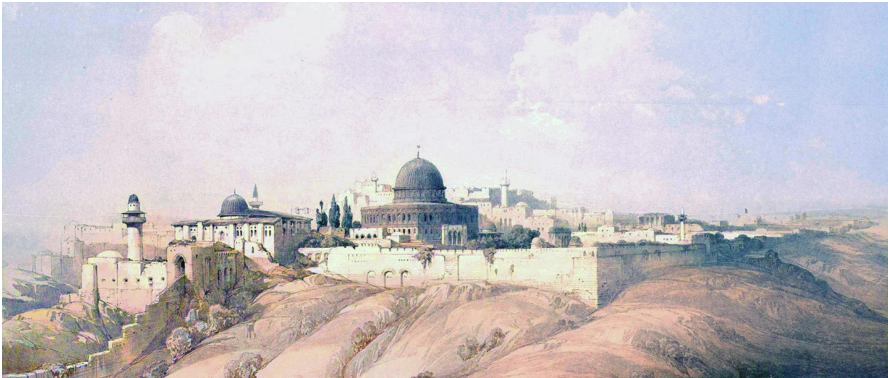
Figure 4: A lithograph of the Haram al-Sharif by David Roberts R.A. in April 1839.

Once again the Temple Mount was bare of buildings, though travellers enjoyed seeing the remains of "Solomon's Temple" on the site. The Anonymous pilgrim of Bordeaux (333) relates, with a lively imagination, that he could see "two large pools at the side of the temple, that is, one upon the right hand, and one upon the left, which were made by Solomon; and further in the city are twin pools, with five porticoes, which are called Bethsaida (Beth-zatha/Bethesda). There persons who have been sick for many years are cured; the pools contain water, which is red when it is disturbed. There is also here a crypt, in which Solomon used to torture devils" 22 The pilgrim goes on to describe two statues of Hadrian not far from the stone where the Jews come every year to mourn.