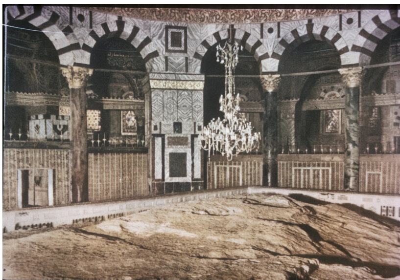
Figure 2: The interior of the Dome of the Rock showing part of the rock and the inner octagon. Image: CJ Davey 1974

that the Dome fell down in 1016 but was restored to its previous condition (1924:13).