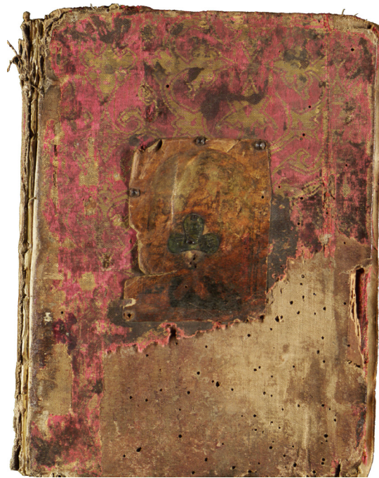
Figure 3: The front cover of Codex Angus