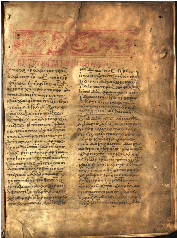
Figure 1: Folium 1, Codex Angus,