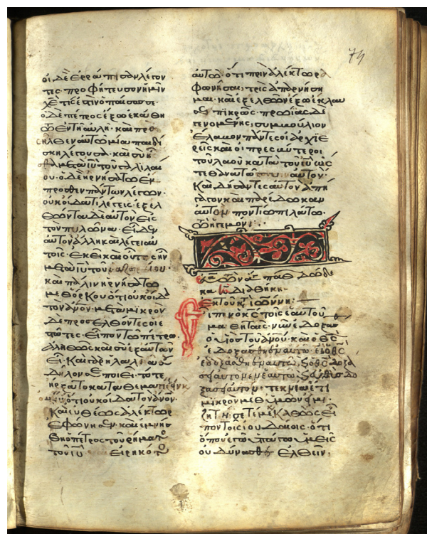
Figure 4: Folium 74, Image: courtesy Rare Books and Special Collections, The University of Sydney Library.

In the centre of the front cover is what appears to be an affixed yet badly decayed decorative parchment panel, measuring approximately 80 x 100 mm, although this