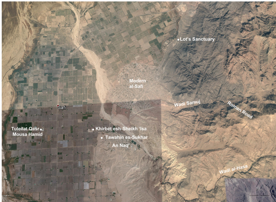
Figure 4: Ghawr es-Safi annotated with sites mentioned in the text and wadi locations. Image: Google Earth, dates 11/9/2012 (bottom left) and 20/10/2004.

Extensive surveys were conducted by the Southern Ghors and Northeast 'Araba Archaeological Survey from 1985–1986 (MacDonald et al. 1988) and more recently, Eretz Ben-Yosef, Mohammad Najjar and Thomas Levy have conducted road surveys from the lowlands to the highlands in the east, identifying more ancient roads (2014). Some of the routes that pass through the wadis are characterised by dense drawings and inscriptions that have accumulated on the rock surfaces over the course of centuries and perhaps millennia. The major easterly route passed through the Wadi al-Dahal to the south of Buseirah, while another crossing was available further to the south through Wadi Fidan, Figure 3. The Ghawr es-Safi Project also mapped a Roman road immediately east of Mousa Hamid along the Wadi Sarmuj leading to the Kerak plateau, Figure 4. Evidence of ancient roads that probably began to flourish during the LBA also exists south through the Arabah Valley. These Arabian trade routes connect Zoar with Elath on the Gulf of Aqaba, known as ‘the way of the Red Sea’ (Deut. 2:1; Num. 21:4) or, ‘the route of the ‘Arabah’ (Bartlett 1989: 39). There was also the so-called ‘road to Edom’, connecting Zoar to the Mediterranean coast; westerly routes from Zoar most likely passed through the Beersheba Valley, which was the most easily traversed valley in the Negev (Singer-Avitz 1999: 7).