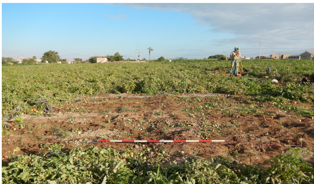
Figure 8: Surface of Square 1, looking north.

The trench was initially excavated from the surface to a depth of 2.6 metres. At this level, a 1m x 1m sondage in the north of the trench was excavated a further 1.8m in depth to virgin soil, a sterile layer of sand, in order to examine the depth of stratigraphy. The results demonstrate two main phases of occupation below the disturbed modern plough-based agricultural strata (Temporary (T.) Stratum I). The first phase (T. Stratum II) was associated with a surface, architectural features and installations at 370m below sea level, or 2.6m below the surface. While excavating in the 1 x 1m sondage, an earlier phase of occupation was identified at 371m below sea level or 3.13m below the surface (T. Stratum III). Between the two phases was a layer of windswept sand, which possibly indicates a period of abandonment.