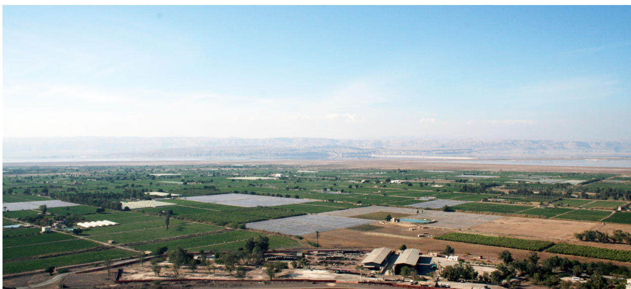
Figure 1: View of the Ghawr es-Safi, looking west.

Mousa Hamid, at 392m below sea level, is one of the lowest places on the earth's surface. Commonly believed to be biblical Zoar (MacDonald 2000: 45), the site forms part of the modern town of Safi, and has views of the mountainous highlands to the east and the shores of Israel to the west. The town is situated in the Ghawr es-Safi, a ghawr is an alluvial fan at the mouth of a wadi entering the Rift Valley flowing down from the highland mountains to the east. This ghawr lies at the mouth of the Wadi al-Hasa on the border of ancient Moab and Edom, Figure 1. The southern extent of Moabite territory to the Wadi Mujib seems explicit enough, while vague references to Moab extending to Zered most likely refer to Wadi al-Hasa (MacDonald 1988: 73; Miller 1989). Both the Wadi Mujib (max. 1.1km deep and 6km wide) and Wadi al-Hasa (max. 1km deep and 7km wide) are dramatic geographic features forming natural topographic divisions.