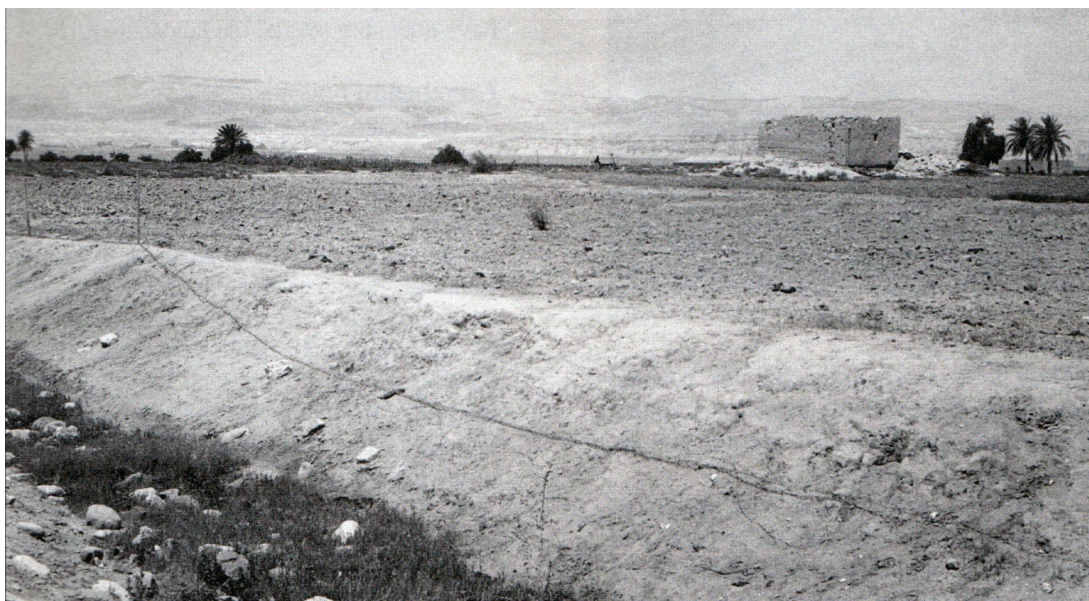
Figure 6: View of Tuleilat Qasr Mousa Hamid, looking northwest. Note the location of the adobe farmstead that belonged to Mousa Hamid Hashoush. Photo: K. Politis, 1999.

The commencement of the recent project developed as the result of a rekindled interest in exploring the IA nature of the site. The lack of robust research at the site served to initiate an intensive survey and excavation in the winter of 2015. Initial investigations involved a detailed topographic and archaeological survey to define the site boundaries, to map the site and to locate potential excavation areas. This survey involved taking points at 5m intervals using Leica Total Station; these points were downloaded into a GIS program and subsequently used to create a contour map of the area, Figure 5.