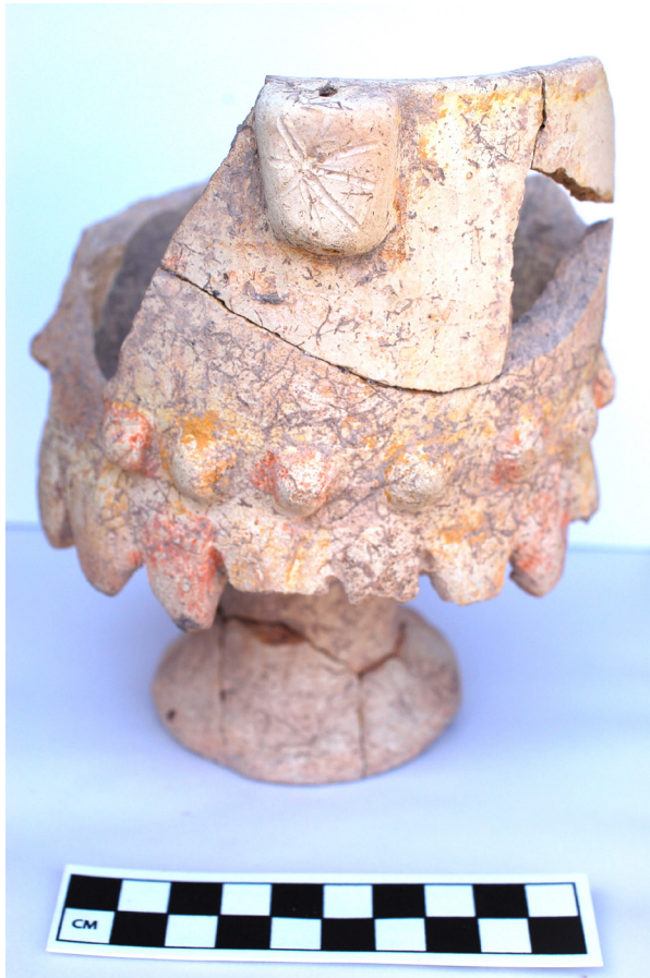
Figure 13: Iron Age IIC decorated chalice. Note the petal décor.

One of the most interesting observations regarding the finds from the current excavation concerns the large ceramic assemblage. The recent excavations at Mousa Hamid yielded approximately 400 kg of pottery from the one trench, with about 2,880 indicative sherds consisting of rims, handles, bases, and miscellaneous distinctive vessel sherds, along with a limited repertoire of decorative wares. The most common decorative treatment was grooving on the exterior of vessels that is covered by a pale slip. A small sample of painted wares means Mousa Hamid can now join the few other Edomite sites in southern Jordan that have produced painted pottery, such as ‘Umm el-Biyara and Tell el-Ghrareh, and Tawilan and Buseirah where they were more common. 8