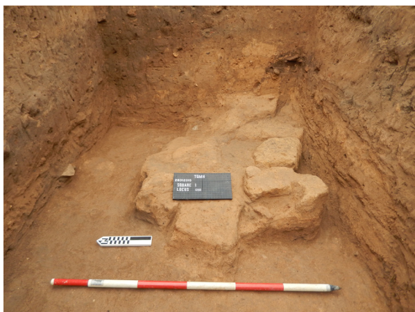
Figure 9: Mudbrick feature.