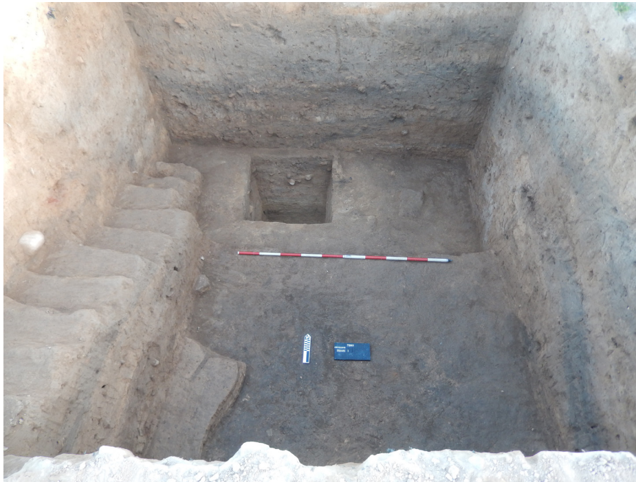
Figure 11: Final stage of excavation with completed sounding .

quantities of debris. The site formation is very interesting; however, it should be noted that at sites such as Nimrin, just 12km north of the Dead Sea, there were three meters of IA II occupation overlying the 10th century stratum (McCreery 1993: 268). Factors such as windswept sands and flooding in the alluvial fan can create deep layers of fill, as can extended periods of accumulated refuse, Figure 11.