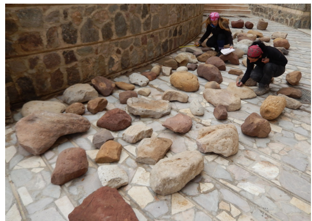
Figure 14: Surface finds from Mousa Hamid at the Safi Museum.

In addition to the large amount of ceramic sherds, an extensive range of utilitarian stone implements indicates that extensive agricultural and industrial activity occurred at this site. Types include pecking stones, pounders, hand grinders, large flint flakes and cores and large tools in the form of grinding bases, loaf-shaped millstones, rollers, mortars and large saddle querns. Many grinding bases and tops are limestone, while querns are generally made of hard dense basalt, Figure 14.