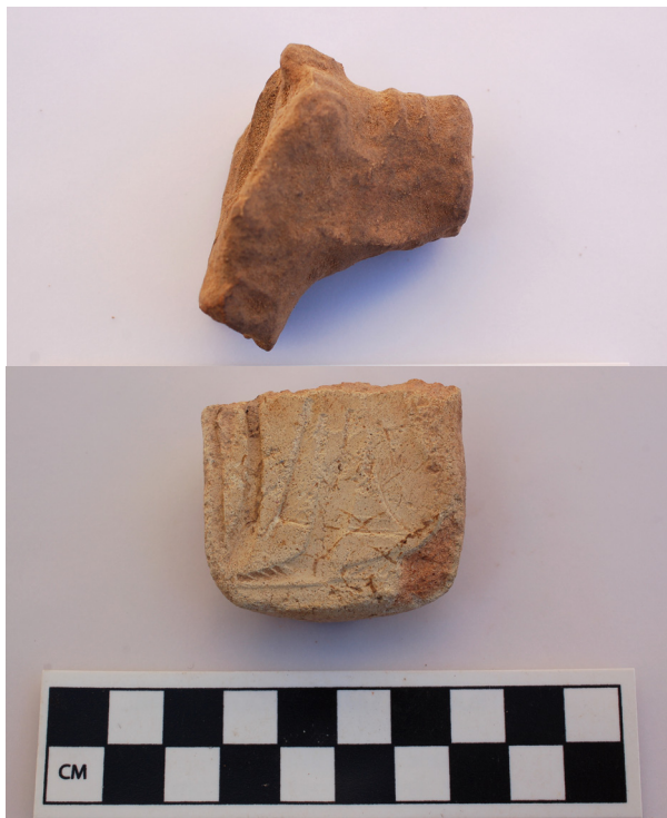
Figure 12: (a) Ceramic horse head figurine, and (b) engraved ceramic stamp seal.

quantities of debris. The site formation is very interesting; however, it should be noted that at sites such as Nimrin, just 12km north of the Dead Sea, there were three meters of IA II occupation overlying the 10th century stratum (McCreery 1993: 268). Factors such as windswept sands and flooding in the alluvial fan can create deep layers of fill, as can extended periods of accumulated refuse, Figure 11.