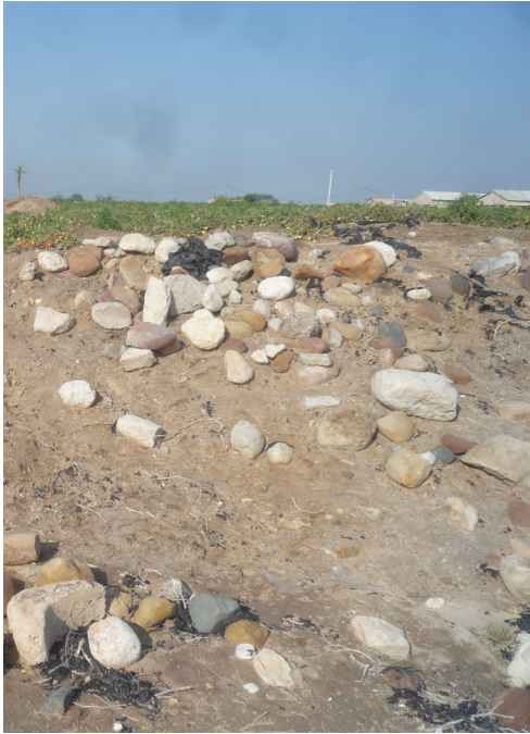
Figure 7: View of stone tools on surface at Mousa Hamid, looking north.

The determination of the site boundary was hindered by external factors, meaning that the delineation of the area to be surveyed was bounded by roads and private property. As there was a high concentration of surface finds within the boundary, it reaffirmed the assumption that we were focusing on a meaningful area. Surface sherds were especially concentrated in a slightly raised zone of the low-lying tell in the vicinity of the original adobe farmstead, the ‘qasr’, that belonged to Mousa Hamid Hashoush, Figure 6 (Politis 1999: 543). As this was a short exploratory season, the primary objective was to designate an area for immediate excavation, rather than collect these sherds.