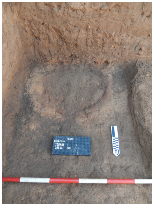
Figure 10: Tabun locus 017.

The removal of the sediment associated with mudbrick collapse revealed evidence of destruction caused by a major burning episode related to the only identifiable surface in the trench. This burning swept across the floor,