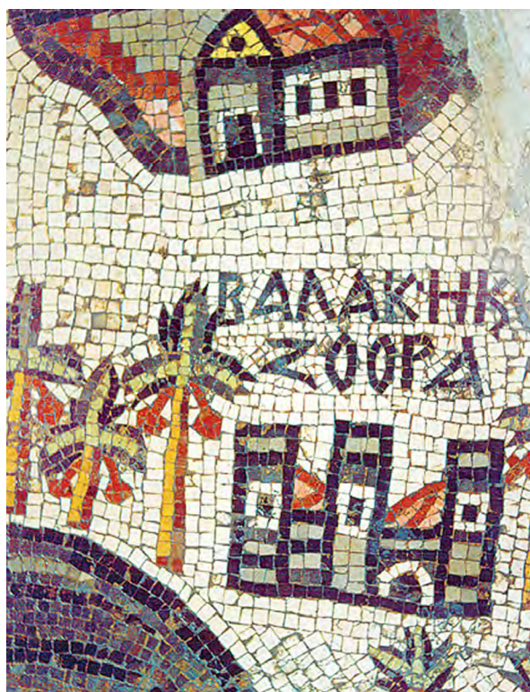
Figure 2: Detail of the late 6 th century mosaic map at Madaba. Note how the site of ‘Zoora’ is surrounded by date palms.

Historians, such as Josephus, Ptolemy, Eusebius and Saint Jerome, position Zoar (Zoara/Seghor/Sughar/Zughar) at the southern end of the Dead Sea (Robinson and Smith 1841: 648–51). The location of a Roman cavalry unit at Zoar was reported in the Notitiae Dignitatum (72). Hierocles refers to it in the geographic tract, Synecdemus (Burckhardt (ed.) 1893), as does George of Cyprus in the Descriptio Orbis Romani (Gelzer (ed.) 1890). Later descriptions of Zoar include those by Fulcher of Chartres and William of Tyre (Fulcher of Chartres 1969; William of Tyre 1976 (1941)). Beautiful descriptions of Zoar