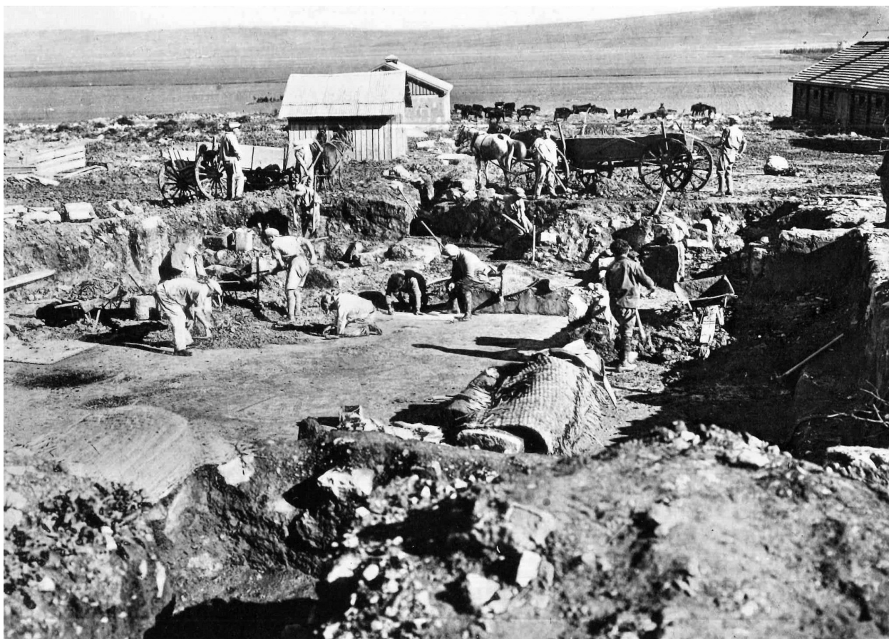
Figure 2: Beth Alpha Excavation, 1929.

emphasized the prominence of the zodiac. The headlines remarked on the “excellent workmanship” of the mosaic floor, and the article noted that “the colors are marvelous examples of early art in designing.” 5 Less than a week later, Sukenik was in Berlin for the centennial celebration of the Berlin Archaeological Institute. The headlines of an article in the New York Times on January 29, 1929 announced that “Old Mosaics Trace Origins of the Jews” and that the discovery of the synagogue “makes New History in Judaism.” 6 The rather sensationalist report, no doubt influenced by Sukenik’s extraordinary enthusiasm for the site, considered the discovery “as important as the recent excavations in Egypt of King Tut-ank-Amen’s tomb.” Sukenik is quoted as saying that “in the history of art we have found at Beth Alpha the connecting link of the road from Jerusalem to Rome.” Moreover, according to the newspaper article, Sukenik explicitly linked Jewish art to Christian art in describing the narrative scene: