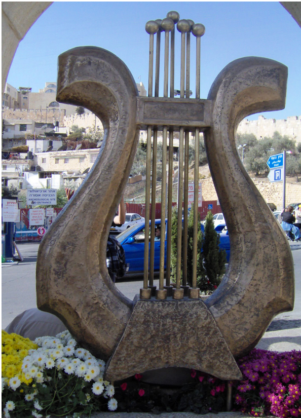
Figure 10: “David’s Harp” marking the entrance to the City of David archaeological park.