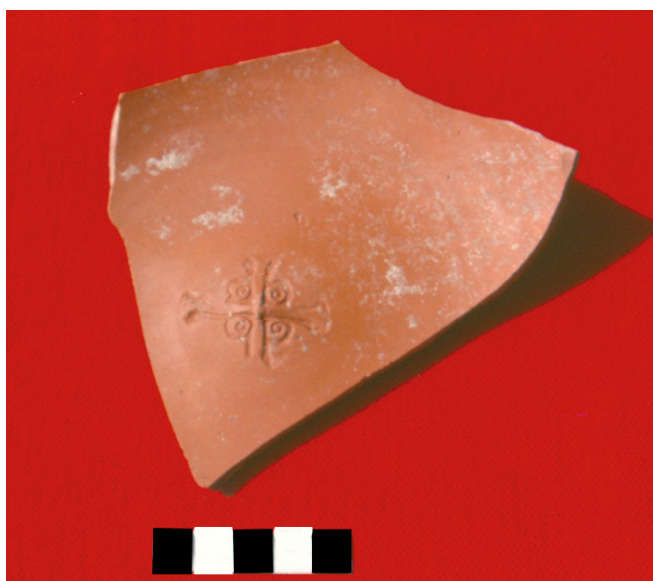
Figure 12: Stamped cross on potsherd discovered at Sepphoris. Courtesy of Sepphoris excavations

Excavations at Sepphoris have since recovered artifacts associated with each of these groups. Pottery and lamps marked with crosses (Figure 12) and menorahs (Figure 13), for example, signify the presence of Jews and Christians; and bronze statuettes of figures from Greco-Roman mythology — Pan and Prometheus (Figure 14) — provide evidence of Roman presence or influence. The many mosaics found at the site also reflect these three cultures: menorahs on a synagogue floor, scenes of Dionysos in a mansion, and an inscription mentioning the bishop Eutropious in the mosaic along a colonnaded street. Architectural elements — miqva'ot (Jewish ritual baths), two synagogues, a theater, two churches, and various civic buildings — likewise represent these three groups. And the presence of pig bones testifies to a non-Jewish