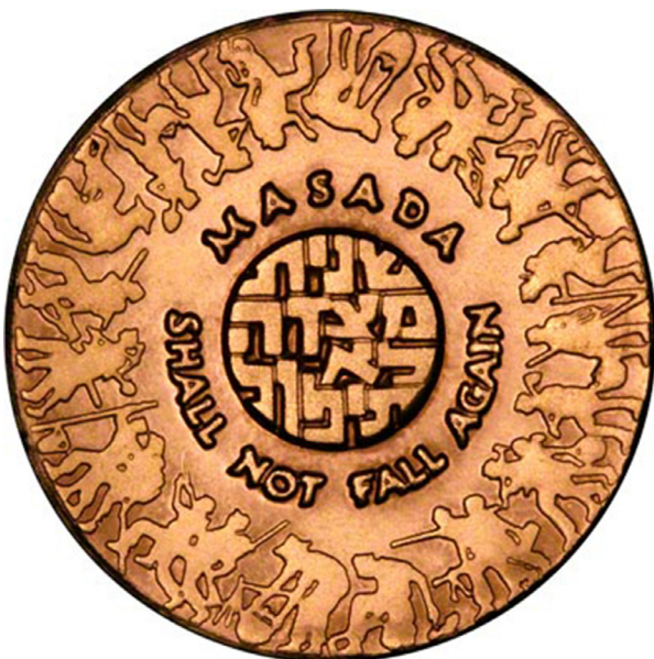
Figure 7: Masada medal bearing the inscription 'Masada Shall Not Fall Again'

As it happens, in 1964-65 we were in Jerusalem and learned of the call for volunteers to work at Masada; we thus joined the excavations for several weeks between