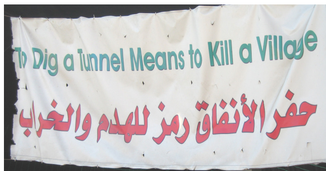
Figure 11: Sign in Silwan opposing Israeli tunnelling.

Most of the archaeologists working under El’ad’s sponsorship are well qualified. Yet, all too often they report their finds in a way that enhances El’ad’s claims about ancient Israelite presence in Jerusalem as justification for expanding current Israeli control. 23 Archaeologists who agree to work with El’ad are implicated in the use of archaeology “as a weapon of dispossession” (Greenberg 2009: 35). Moreover, not only have archaeology, religion, and nationalism become intertwined at the City of David, but the site’s “theme-park tourism” (Greenberg 2009) has distorted the archaeological remains. The signs posted at the site along with the El’ad-controlled visitor’s center and publications foster what can be called a fundamentalists and one-sided approach to the cultural history of this part of Jerusalem. The Canaanite remains are virtually ignored; and the Iron Age and later remains are considered evidence of the ancient Israelites and their Jewish successors. El’ad’s presentation of the site effectively proclaims the area to be part of the Jewish homeland and the rightful property of the state of Israel and Jewish people. There is no room in such an approach for the Palestinians who live in Silwan today or the Canaanites (or Jebusites, see 2 Sam 5:16-10) who lived there in the pre-Israelite past.