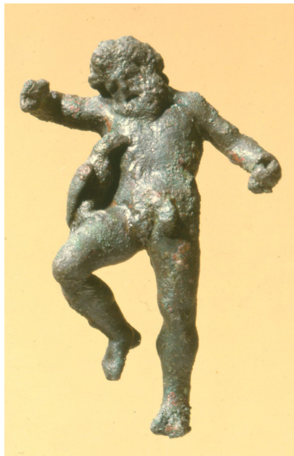
Figure 14: Bronze statuette of Prometheus.

in a different direction. The Sepphoris antiquities are in a national park, and the Israel Nature and Parks Authority (INPA) along with the IAA (both government agencies) is in the process of upgrading the facilities and signage at the site and also consolidating the deteriorating walls of many of the excavated buildings. It is our understanding that the Jewish presence at Sepphoris will be emphasized — a move which is in line with the decision, made years ago despite our attempts that it be otherwise, to exclude the Crusader church from ready access to tourists. It is also in line with the Zippori (Sepphoris) page on the INPA website, which calls Sepphoris a “talmudic-era city,” a chronological designation that effaces Roman and Christian presence. 30 The nationalism of these government agencies is superseding the possibilities for having the site highlight the coexistence of Jews, Romans, and Christians in antiquity. The government may prefer to provide a nationalist message by emphasizing the Jewish presence there, but many of its excavators continue to hope that Sepphoris’s multicultural past can be a force for peace. Indeed, the inscription on a coin of Nero, dated to 67–68 C.E., refers to Sepphoris as “Eirenopolis” (“City of Peace”; Figure 15). 31