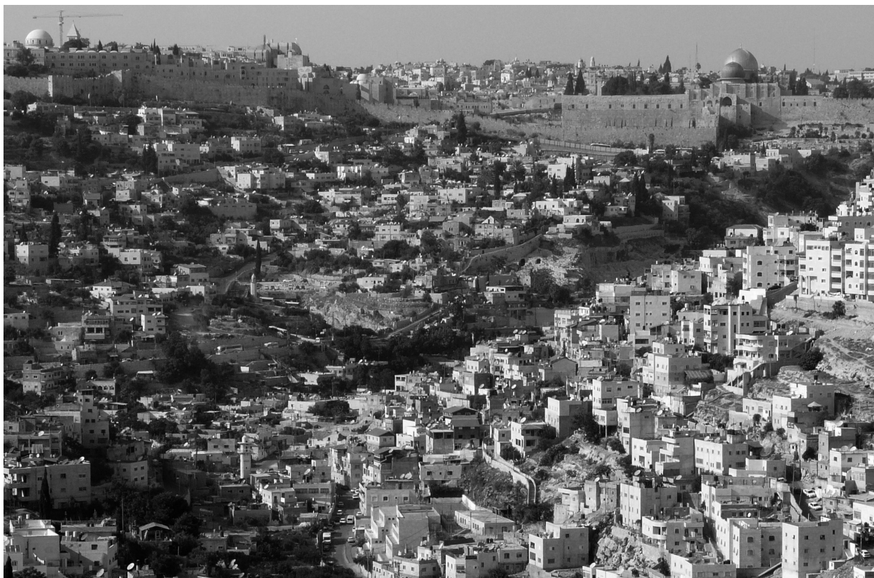
Figure 9: Silwan, the village in which the City of David is located (on the spur in the center of the photo).

We recount this story to create a context for considering the sponsorship of much subsequent work in Jerusalem and to indicate what is at stake when scientific inquiry is underwritten by people with political and/or religious