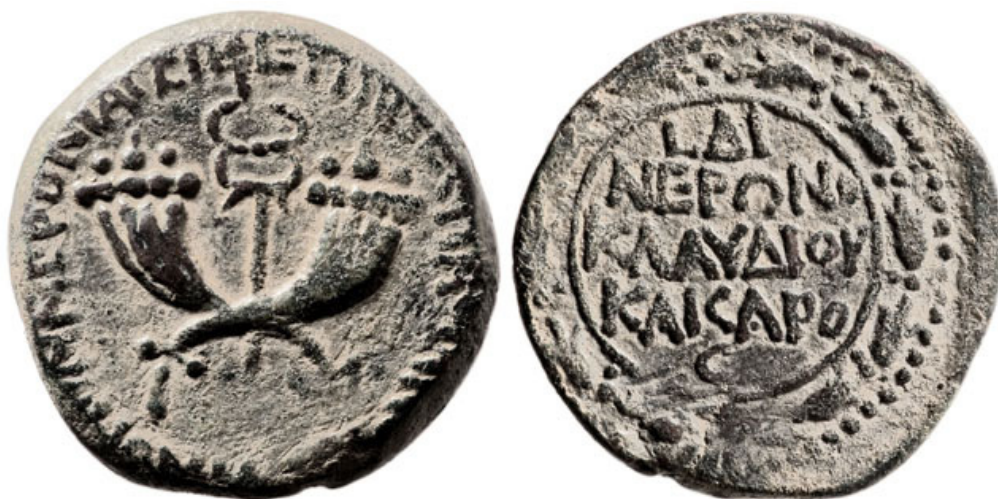
Figure 15: Nero coin with inscription on obverse referring to Sepphoris as “Eirenopolis” (City of Peace).

In sum, the past retrieved by archaeologists clearly is not passive. Social, religious, and political issues in the archaeologists’ present inevitably impact the way many sites are selected, excavated, displayed, and interpreted, especially when local governments or other organizations are charged with excavating or maintaining a site. At its extreme, data from the past are manipulated or used selectively to promote a present-day agenda—and scholars continually try to expose and correct ideas that stem from the distortion or misinterpretation of data. Even with all these problems, we believe that the use of the past for present-day purposes can nonetheless be valuable, if for no other reason than it helps maintain an interest in and support for the archaeology of the Holy Land. We can thus continue to learn about the history and culture of all peoples who lived there over many millennia. One of the students of our course on Holy Land Archaeology perhaps summed it up best: “Archaeology does things. It is not an isolated study of rocks or remains, nor a collection of facts that collects dust on a shelf. Archaeology is the umbilical cord tethering the present to the past.” 32