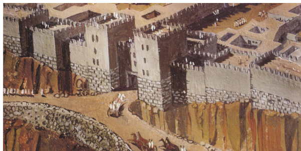
Figure 4: Reconstruction drawing of massive Canaanite fortifications uncovered by Yadin at Hazor.

The Hazor expedition produced spectacular results, revealing many successive Bronze Age cities spanning nearly two millennia. The discoveries included monumental architecture — massive ramparts and gates, elaborate temples with cultic stele and statues, and impressive palaces — all associated with the Canaanites of the Middle and Late Bronze Ages (Figure 4). Yadin’s expedition also uncovered evidence of an extensive conflagration