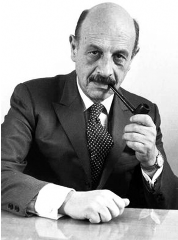
Figure 3: Yigael Yadin, director of Hazor and Masada excavations, in 1978.