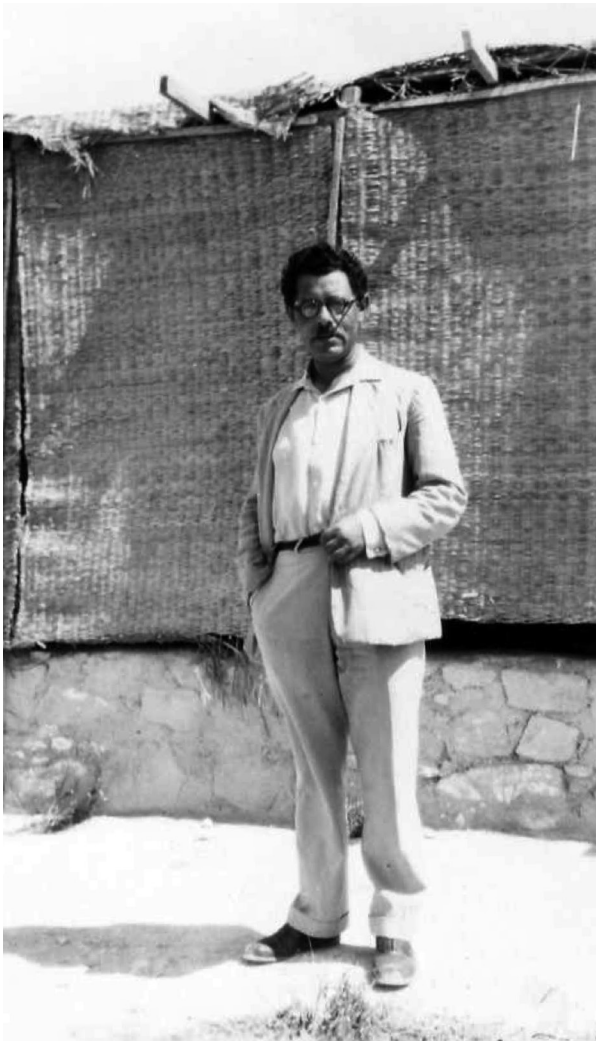
Figure 1: Eliezer Lipa Sukenik at Samaria 1933.

newspaper articles) and excavation reports and also draw on anecdotal evidence, often from their own experiences as students and then excavators in Israel since the 1960s. It is not meant to be a theoretical or general analysis of the complex ways in which Holy Land archaeology has functioned beyond its basic goals of understanding past societies; many books and articles have been written on this subject, and the reader is referred to them. 4 Rather, it provides information about five sites (Beth Alpha, Hazor, Masada, Jerusalem, and Sepphoris) that collectively show how excavations can contribute to our understanding of the ancient occupants of the Holy Land but can also serve nationalist functions or religious interests or both.