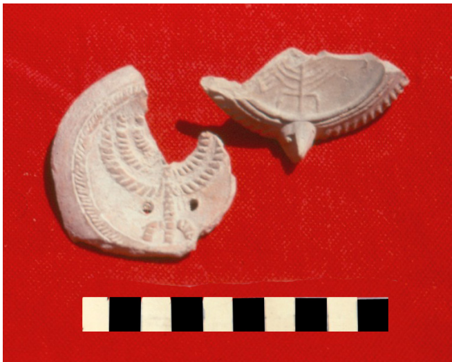
Figure 13: Menorahs on lamps found at Sepphoris.

population in certain areas or periods, whereas the absence of such bones in other areas signifies a Jewish presence. 27